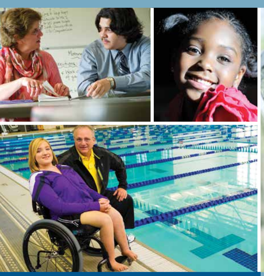
Fostering "Can-Do" Attitudes at Work and in Life

for the Campaign for Disability Employment's Public Service Announcement " Because "